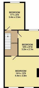
FIRST FLOOR APPROX. FLOOR AREA 113 SQ.FT. (10.5 SQ.M.)

TOTAL APPROX. FLOOR AREA 265 SQ.FT. (24.5 SQ.M.)