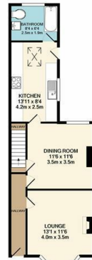
GROUND FLOOR APPROX. FLOOR AREA 152 SQ.FT. (14.0 SQ.M.)