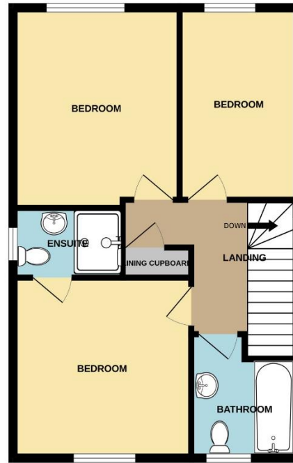
1ST FLOOR 534 sq.ft. (49.6 sq.m.) approx.