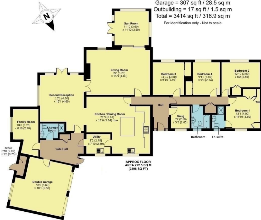
APPROX FLOOR AREA 222.5 SQ M (2396 SQ FT)