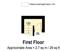
First Floor Approximate Area = 2.7 sq m / 29 sq ft

(Including Basement / Loft Room) Approximate Gross Internal Area = 102 sq m / 1089sq ft