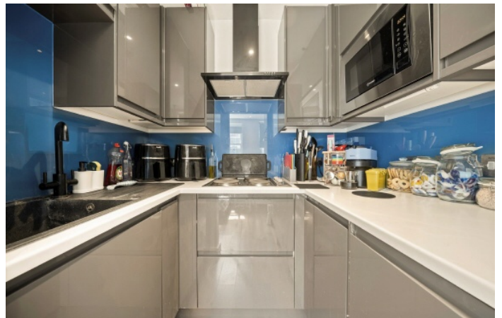
Kensington High Street, W8