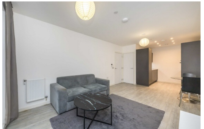
Ironworks Way, E13