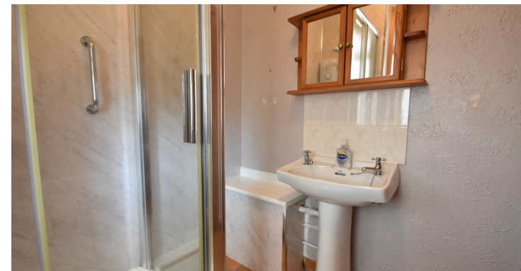
24 Avondale Crescent