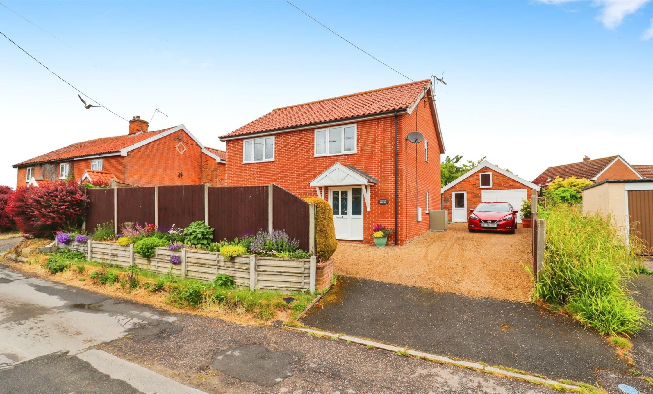
Henge House Druids Lane, Shelfanger Diss IP22 2DN