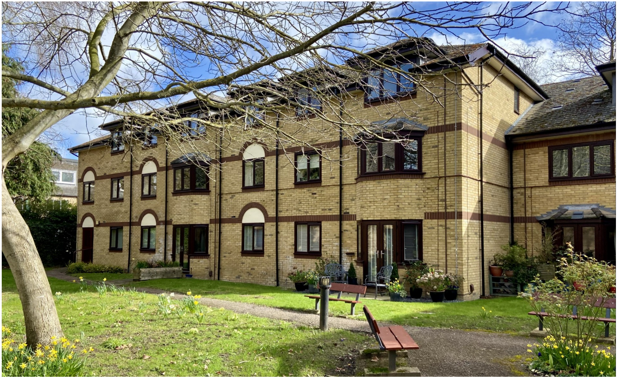
Burling Court, Cambridge, Cambridgeshire CB1 8EB