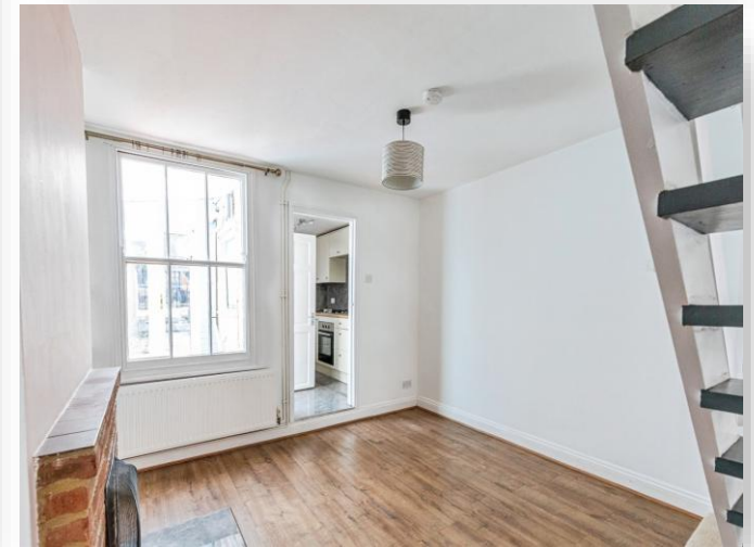
Jubilee Street, Irthlingborough Wellingborough NN9 5RL