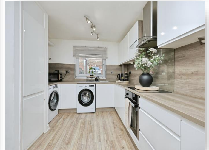
Thorpe Heights, Rosary Road, Norwich, NR1 4BU