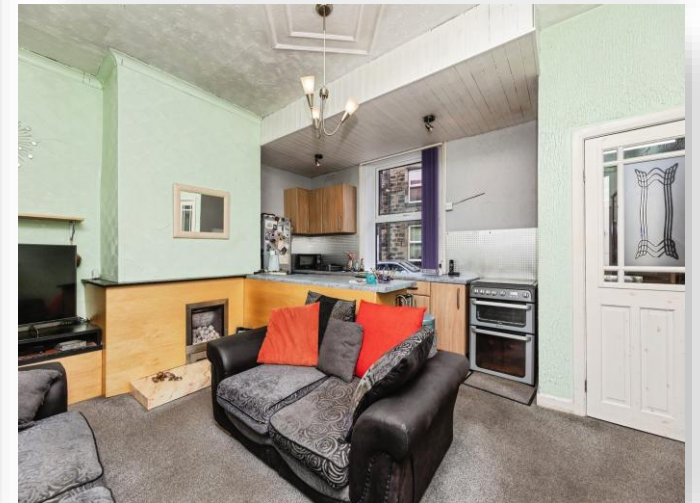
Britannia Square, Morley Leeds LS27 0AT