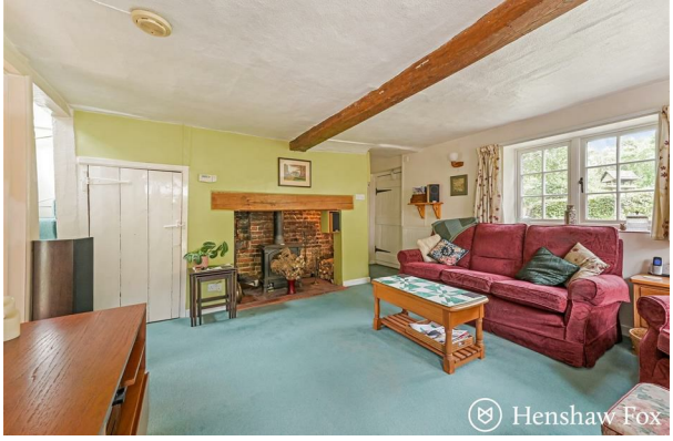
Hillside Cottage Jerrems Hill | £850,000 Mottisfont, Hampshire, SO51 0AB