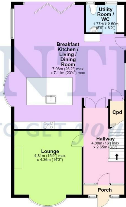
Ground Floor Approx. 87.3 sq. metres (940.0 sq. feet)