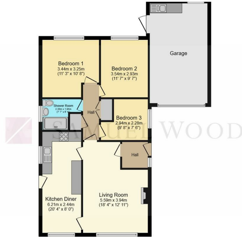
Floor Plan Floor area 99.2 sq.m. (1,068 sq.ft.)

Total floor area: 99.2 sq.m. (1,068 sq.ft.)