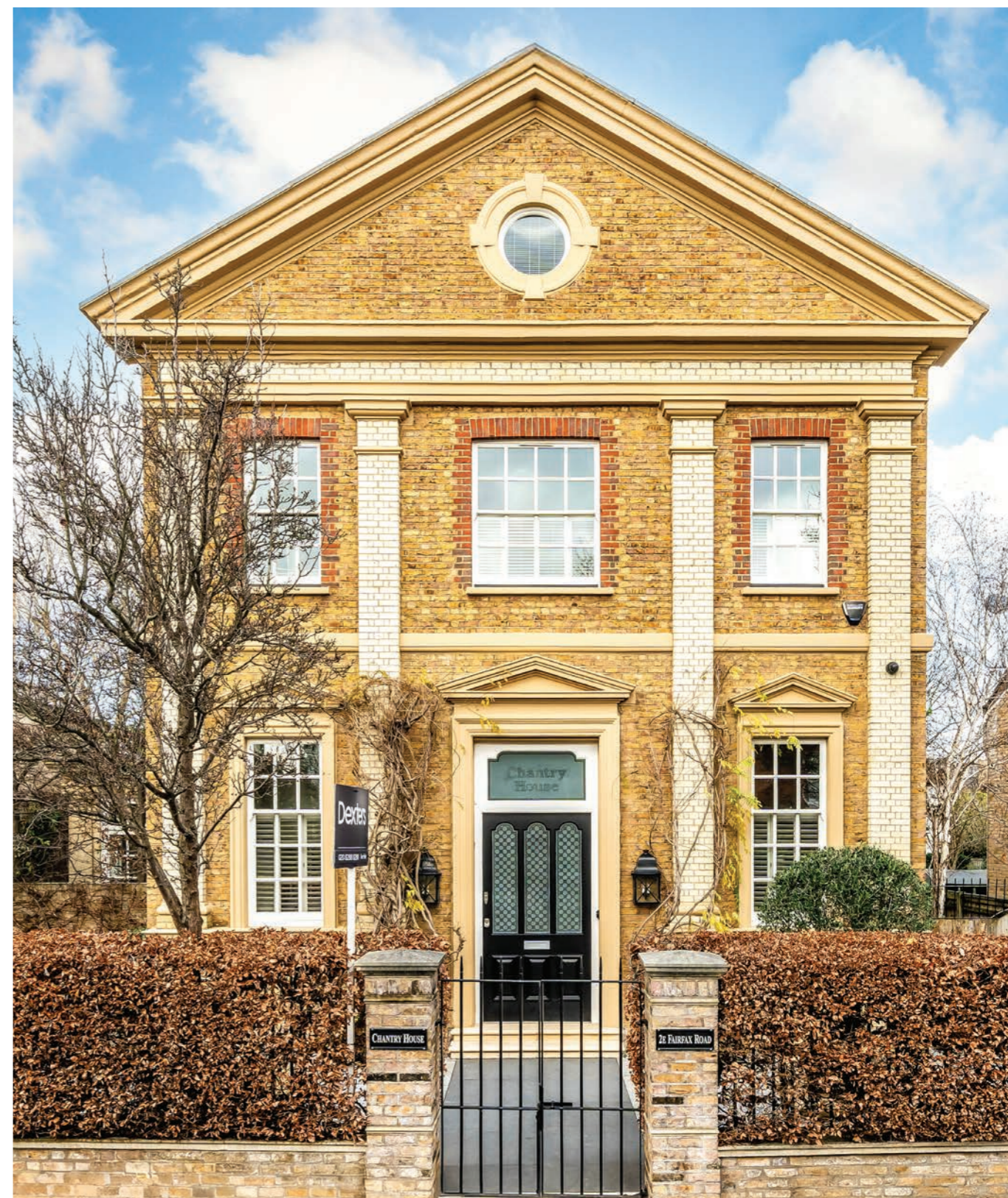
Chantry House Teddington