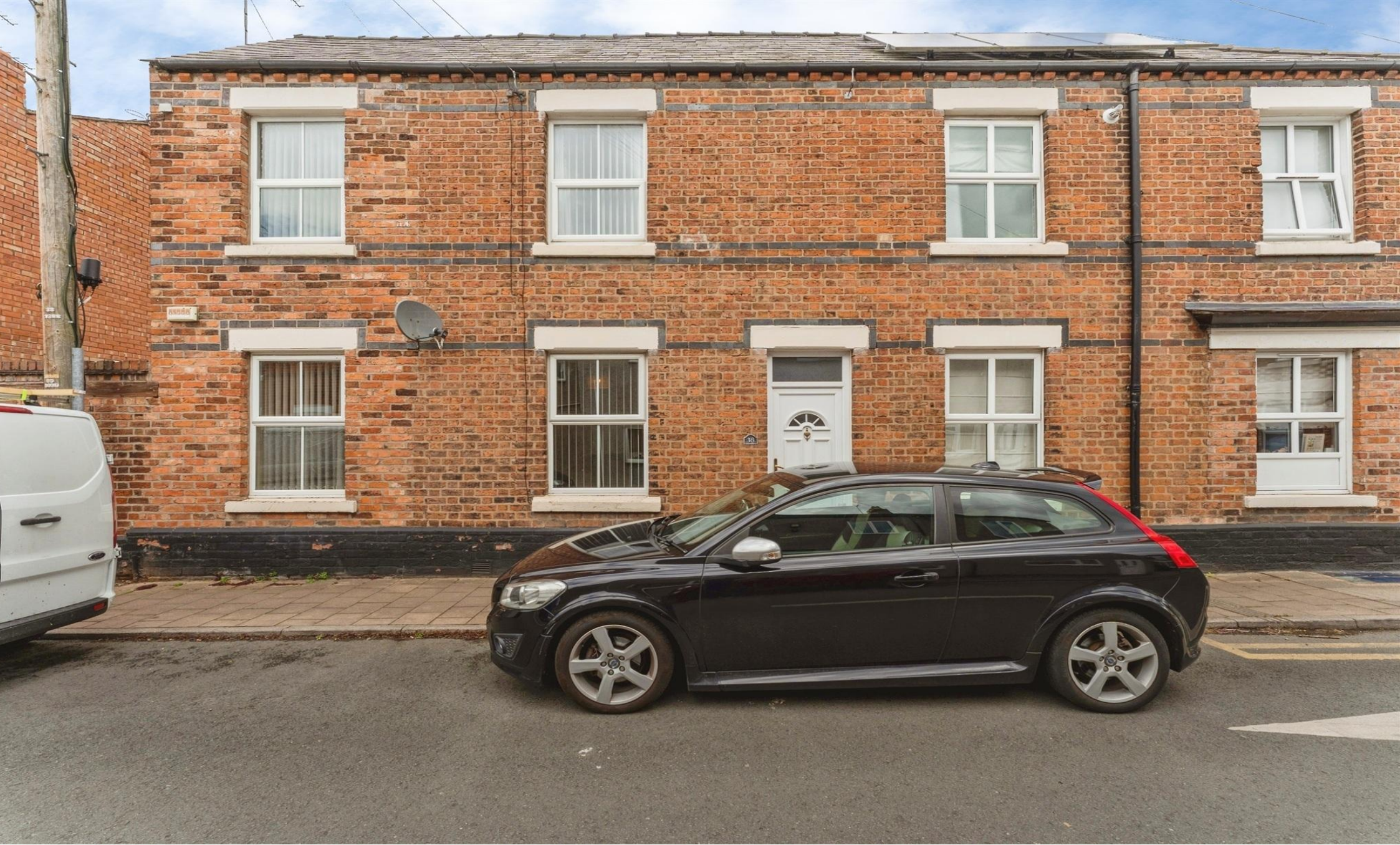
Phillip Street, Chester CH2 3BY