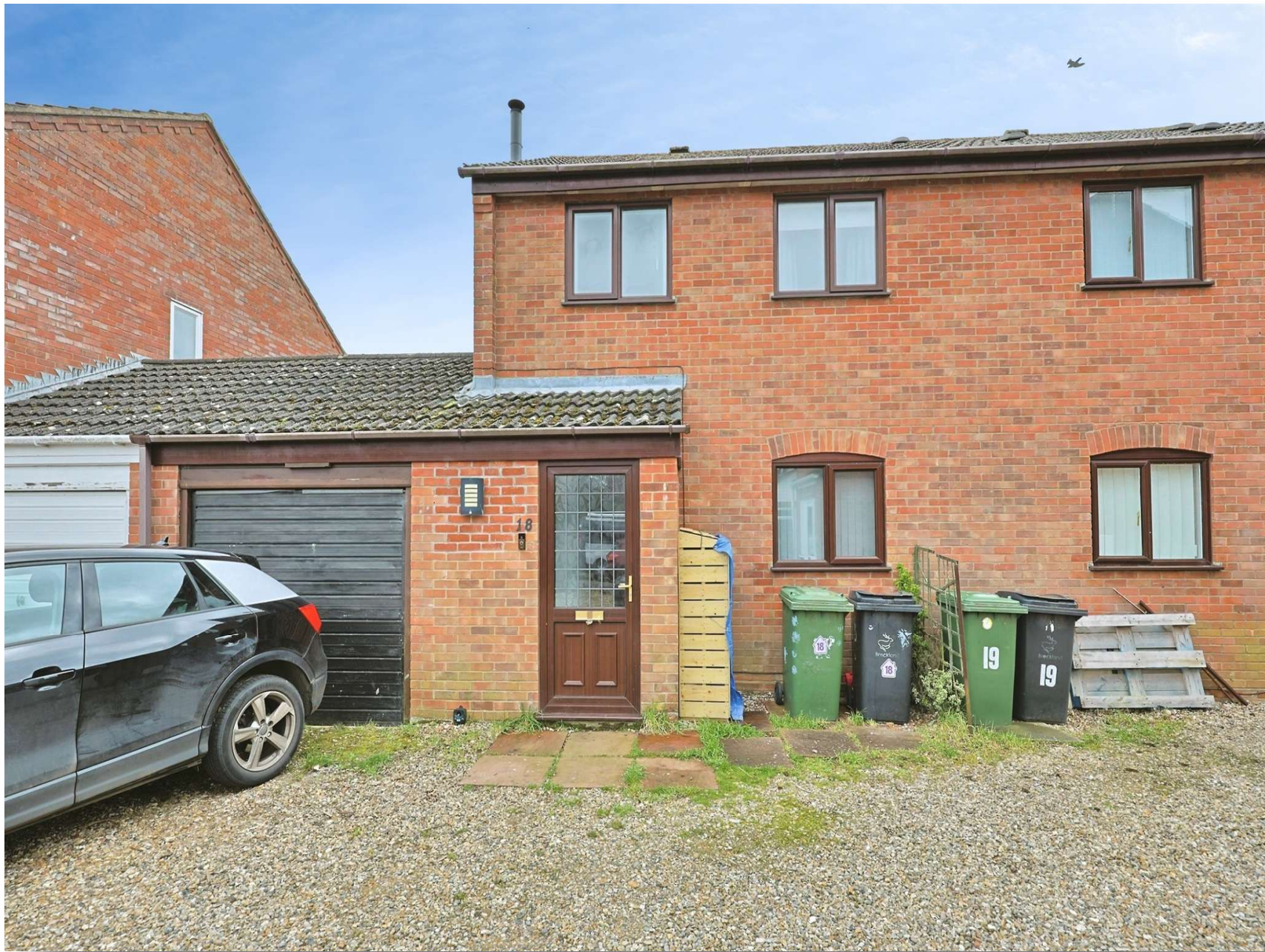
Oakwood Close, Dereham, NR19 2ST