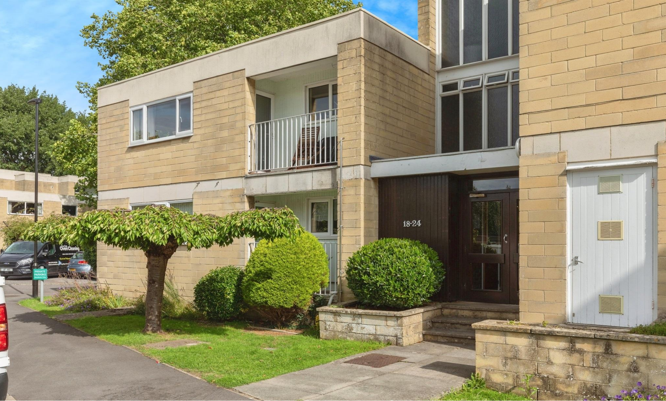
Hampton House, Grosvenor Bridge Road, Bath, BA1 6BE