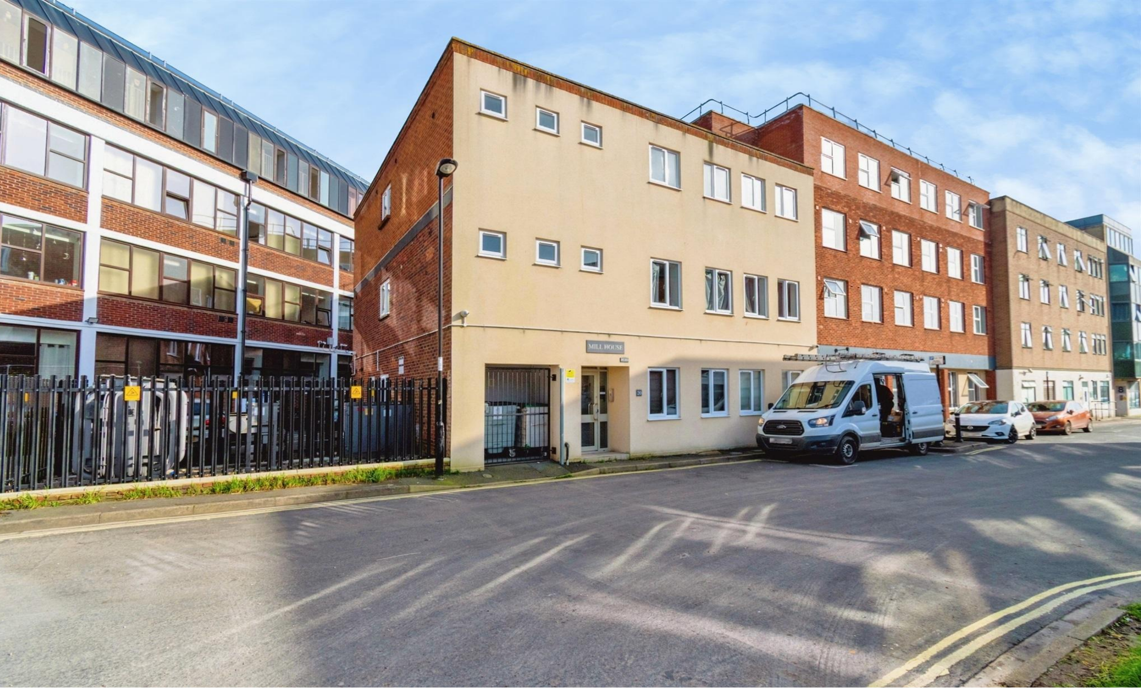
Mill House, Southampton Street, SOUTHAMPTON SO15 2ED