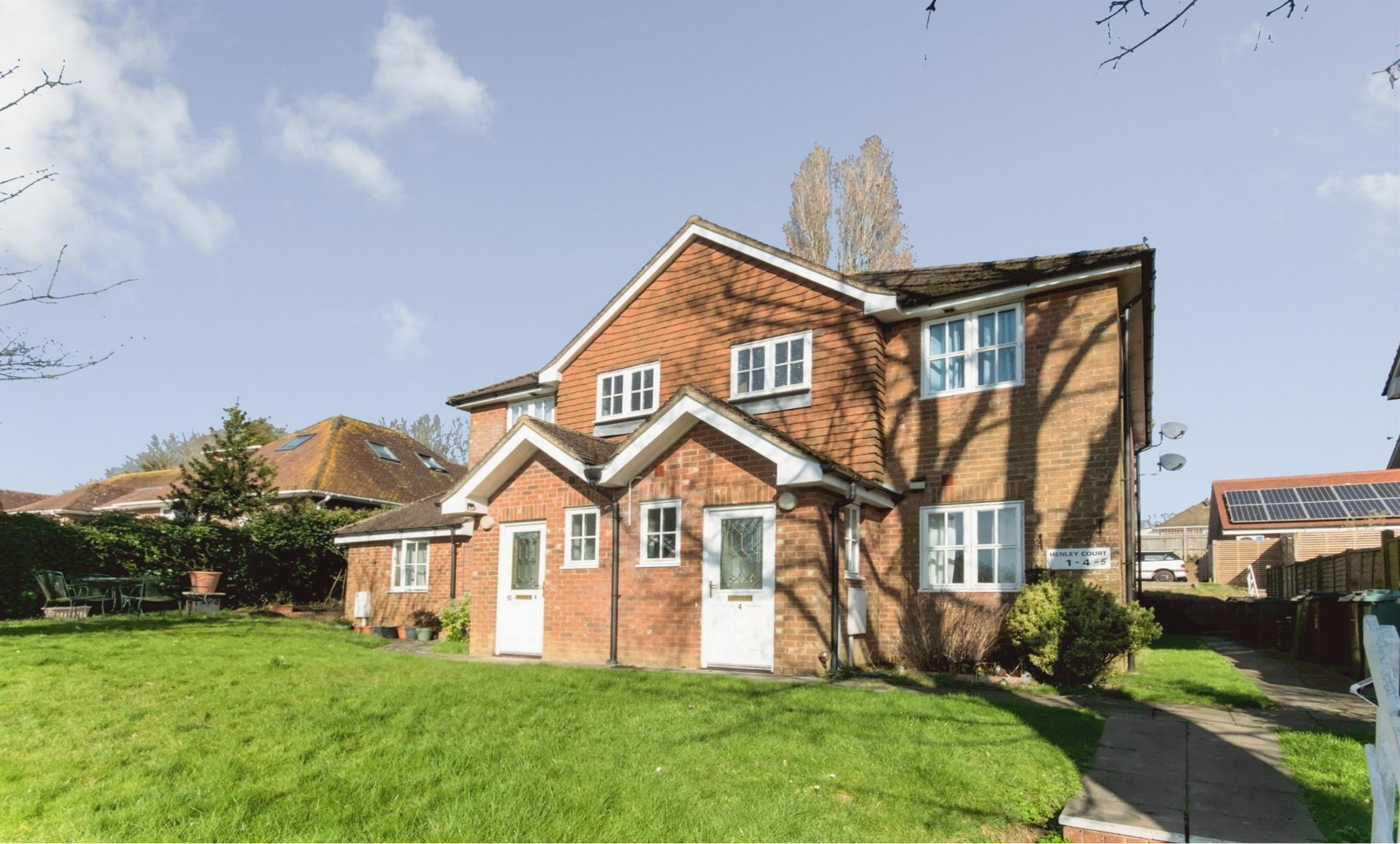
Henley Court - Woodsgate Park, Bexhill-On-Sea TN39 4DL