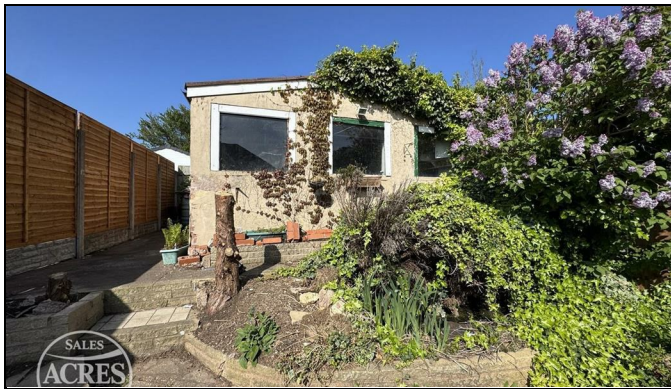
Lechlade Road, Great Barr, B43 5NF