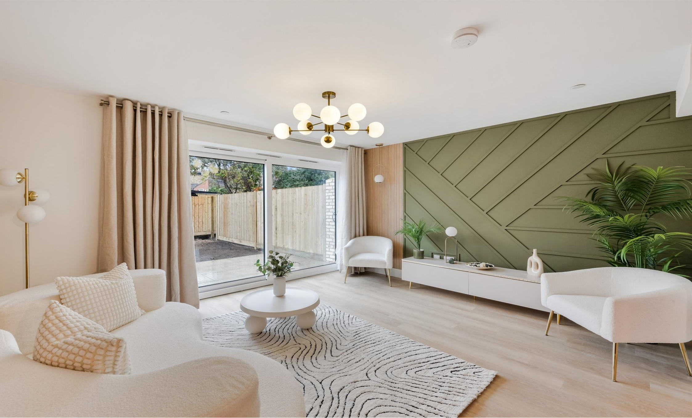
Penshurst Mews Fenham Road, London SE15 1AE