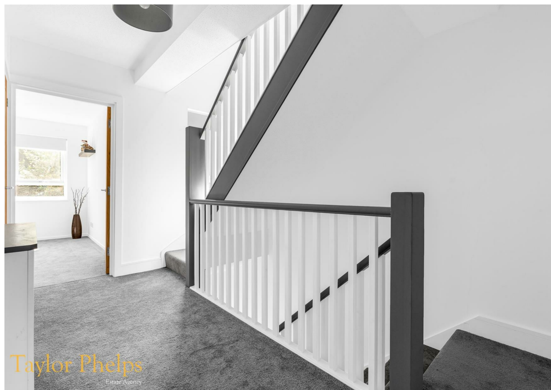
Taylor Phelps Estate Agency