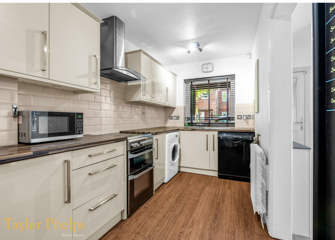
Taylor Phelps Estate Agency