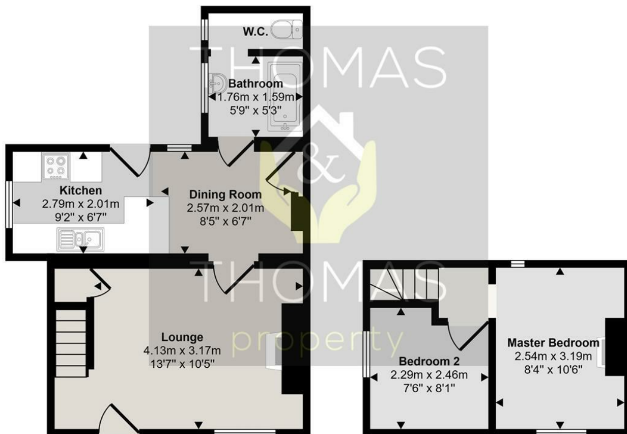
Ground Floor Approx 33 sq m / 357 sq ft

Approx Gross Internal Area 49 sq m / 531 sq ft