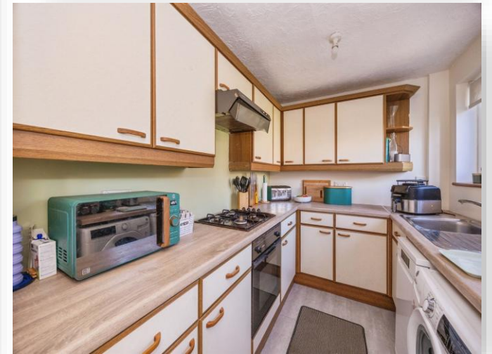
Bitterne Close, Havant PO9 5EN