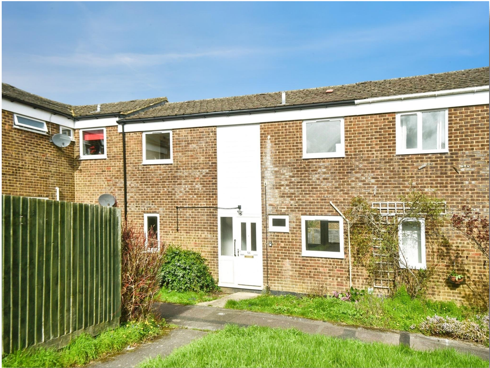
Kennedy Drive, Swindon SN3 3SD