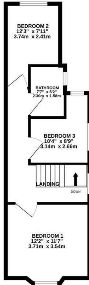
1ST FLOOR 436 sq.ft. (40.5 sq.m.) approx.