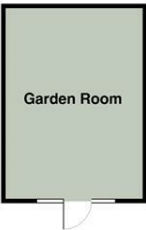
Sutton Oak Road, Sutton Coldfield

THIS PLAN IS NOT TO SCALE AND IS GIVEN TO PROVIDE A GENERAL GUIDE. IT MERELY INDICATES APPROXIMATE RELATIONSHIP OF ONE ROOM TO ANOTHER.