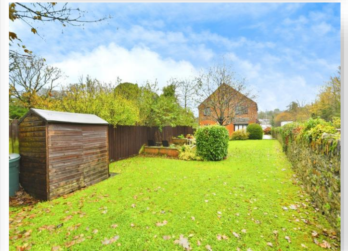
St. Marys Close, Plymouth PL7 4QJ