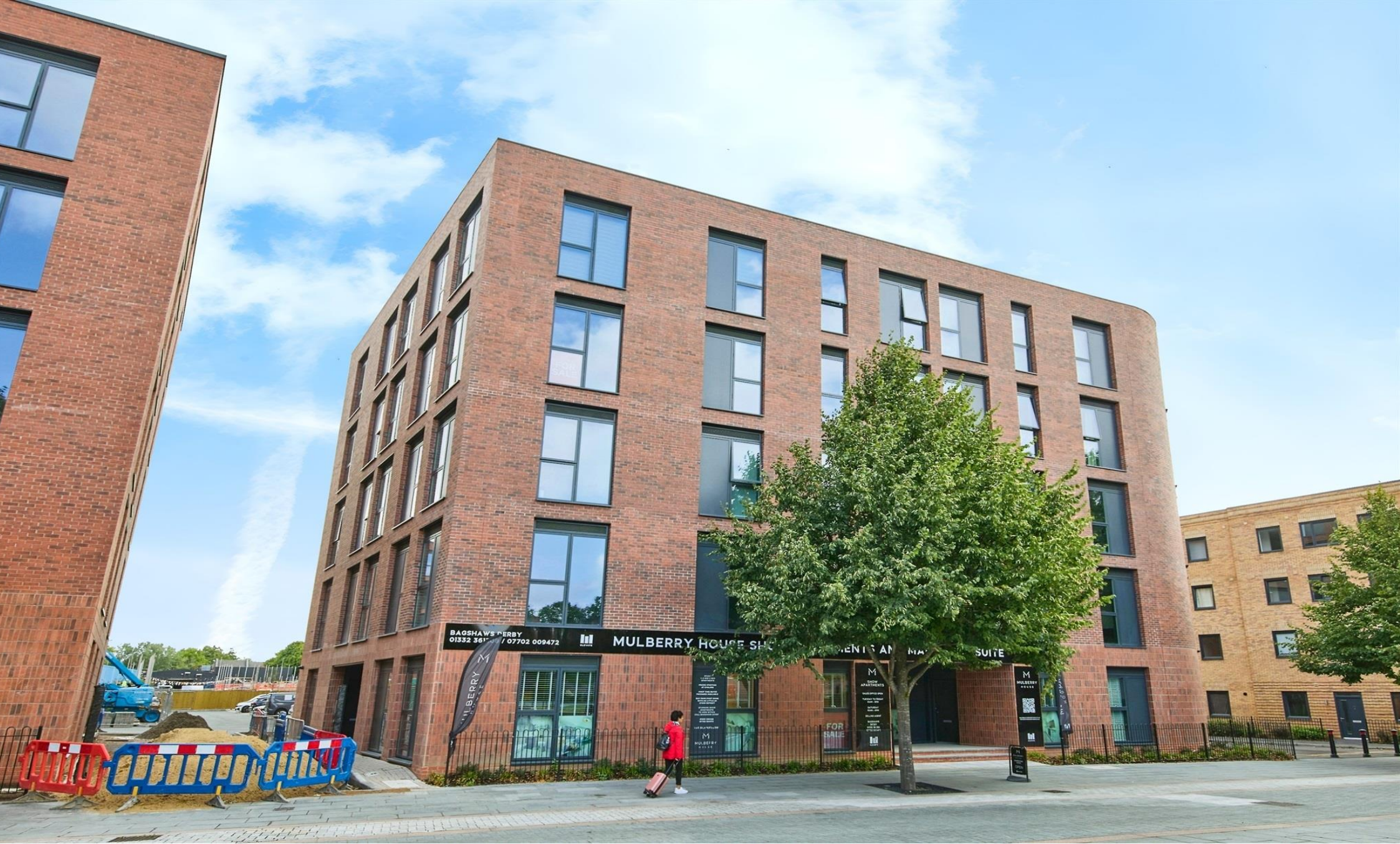
Mulberry House, Castleward Boulevard ,Derby, DE1 2FQ