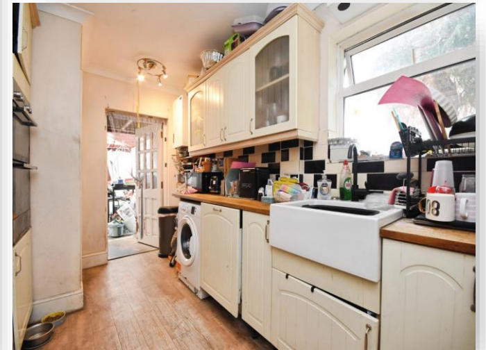
Fairview Cottage, Colchester Road, Chappel, COLCHESTER, CO6 2AE