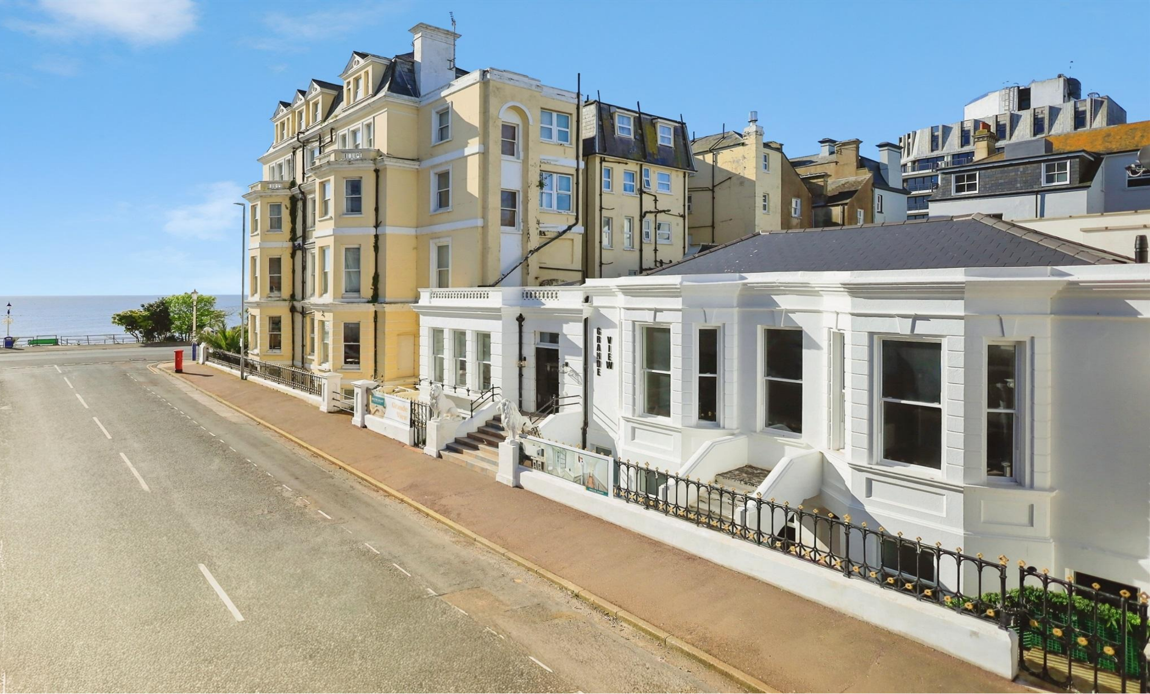
Grande View, Eastbourne BN21 4AR