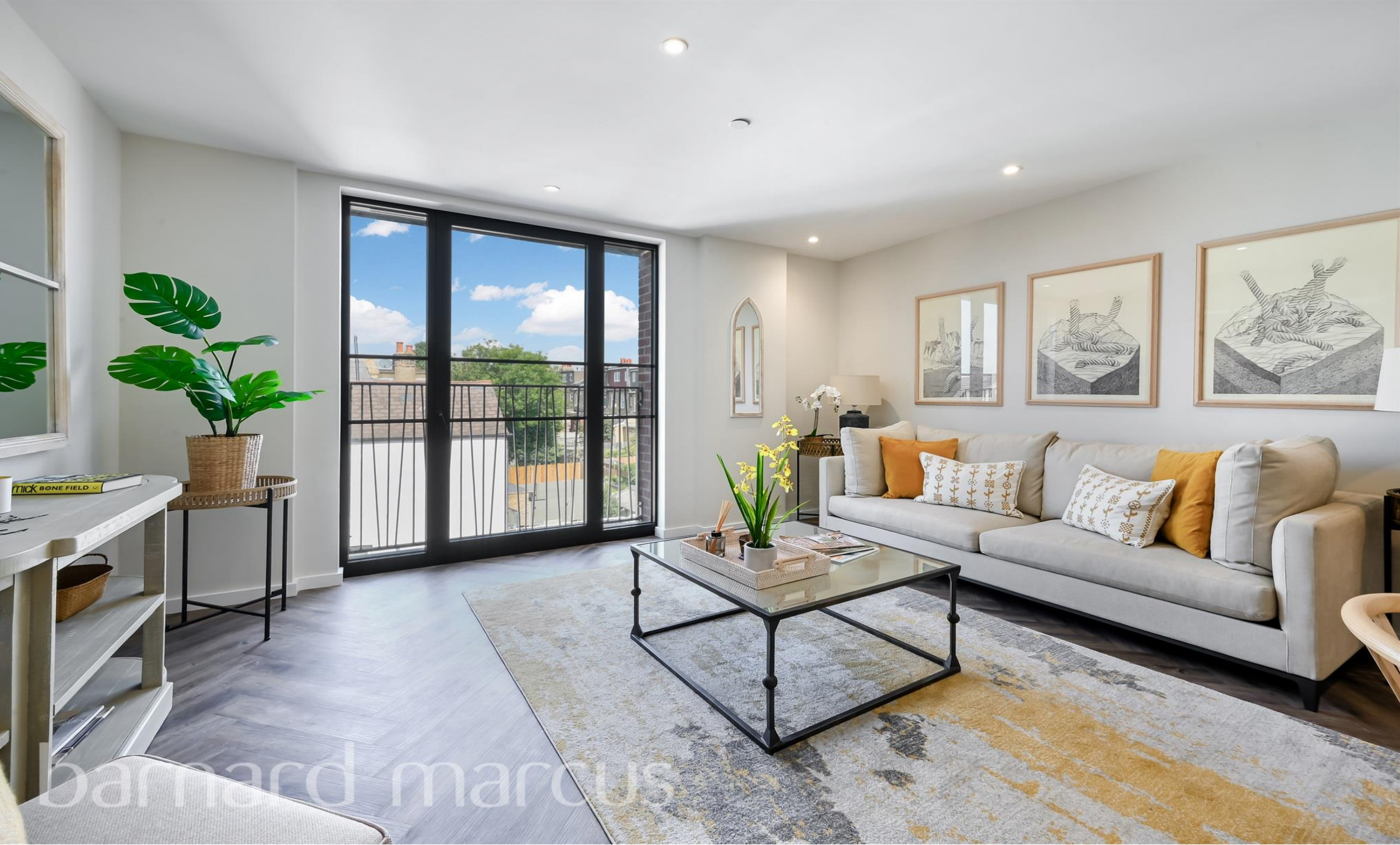
Meadow House Fallsbrook Road, London SW16 6DY