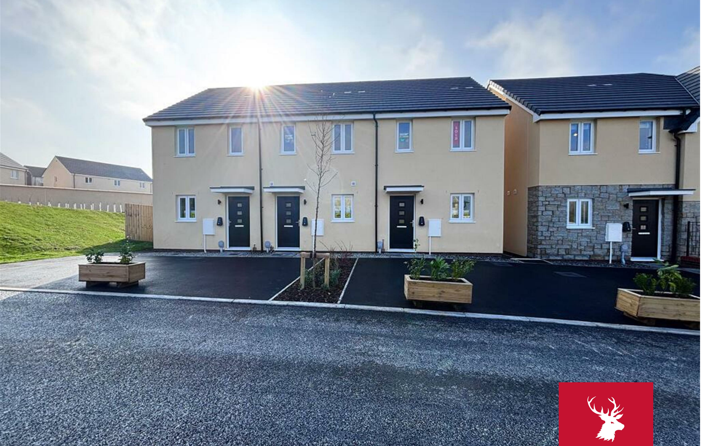
The Alnmouth, plot 132