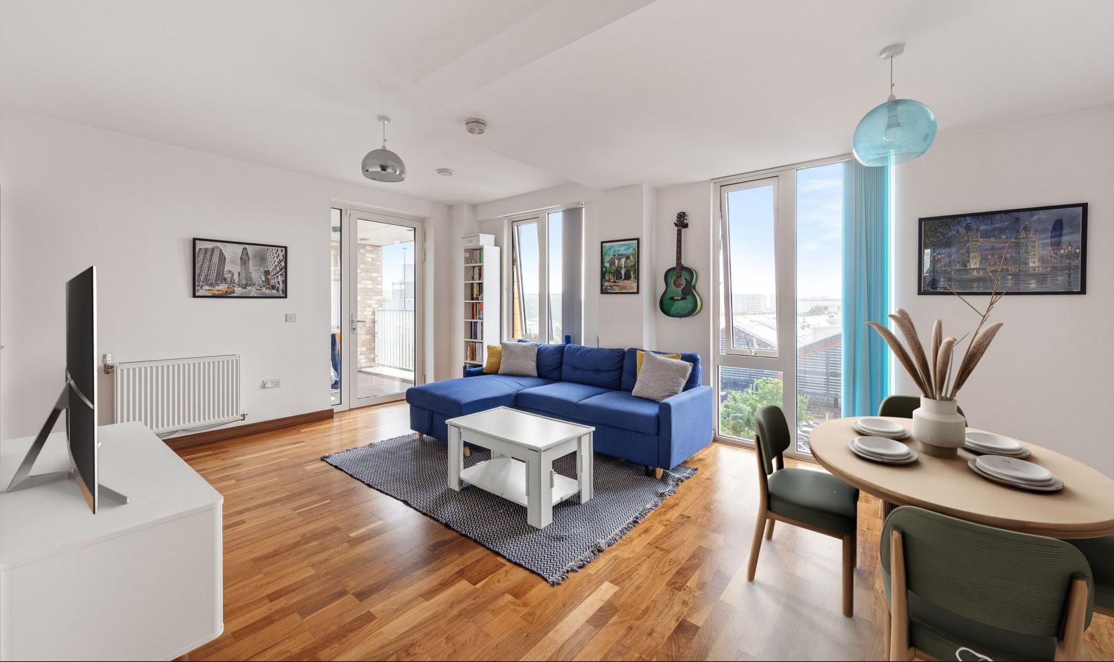
Elliot Lodge, 7 Cyrus Field Street, London SE10 0XN