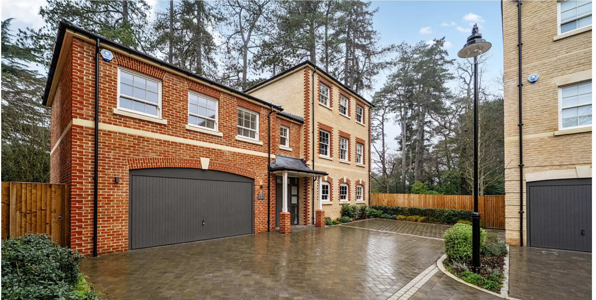
SCHOLARS ROW, Ascot SL5