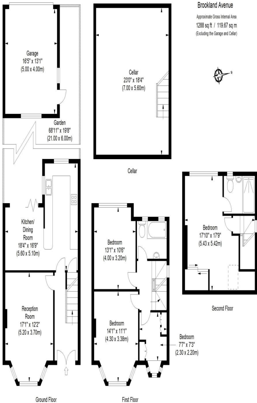
ILLUSTRATION FOR IDENTIFICATION PURPOSES ONLY

ALL MEASUREMENTS ARE MAXIMUM, AND INCLUDE WINDOW BAYS AND WARDROBES WHERE APPLICABLE THIS PLAN MUST NOT BE REPRODUCED BY ANY OTHER PERSON WITHOUT PERMISSION