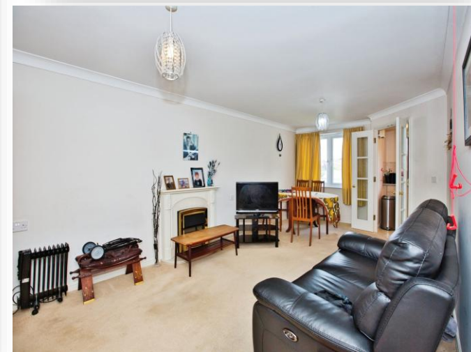
Wyndham Court, Yeovil, BA21 4HB