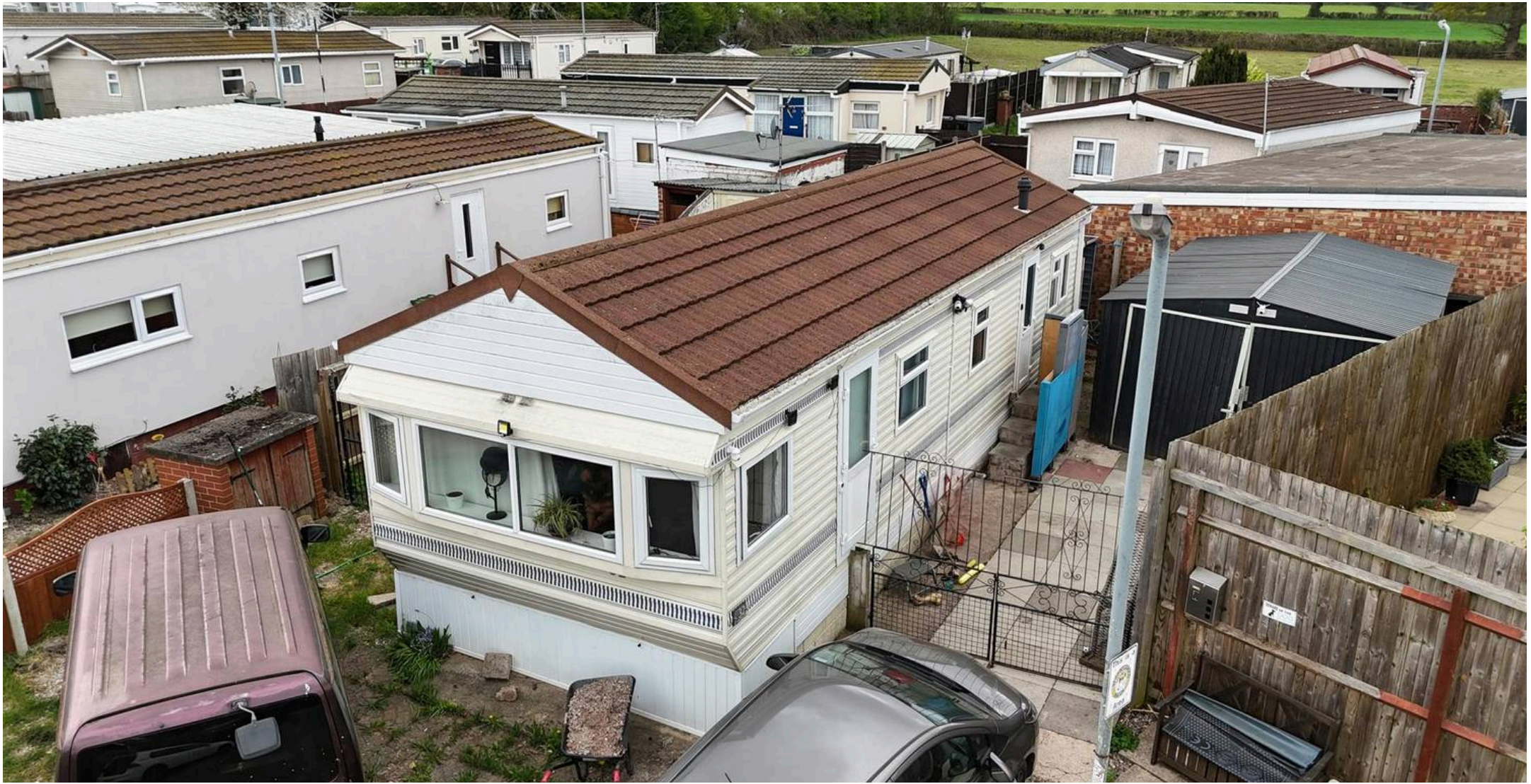
32 High View Drive, Ash Green Coventry