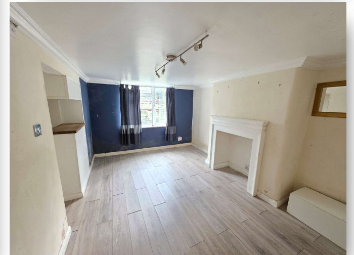
Garden Flat Bicester Road, Aylesbury HP19 8AD