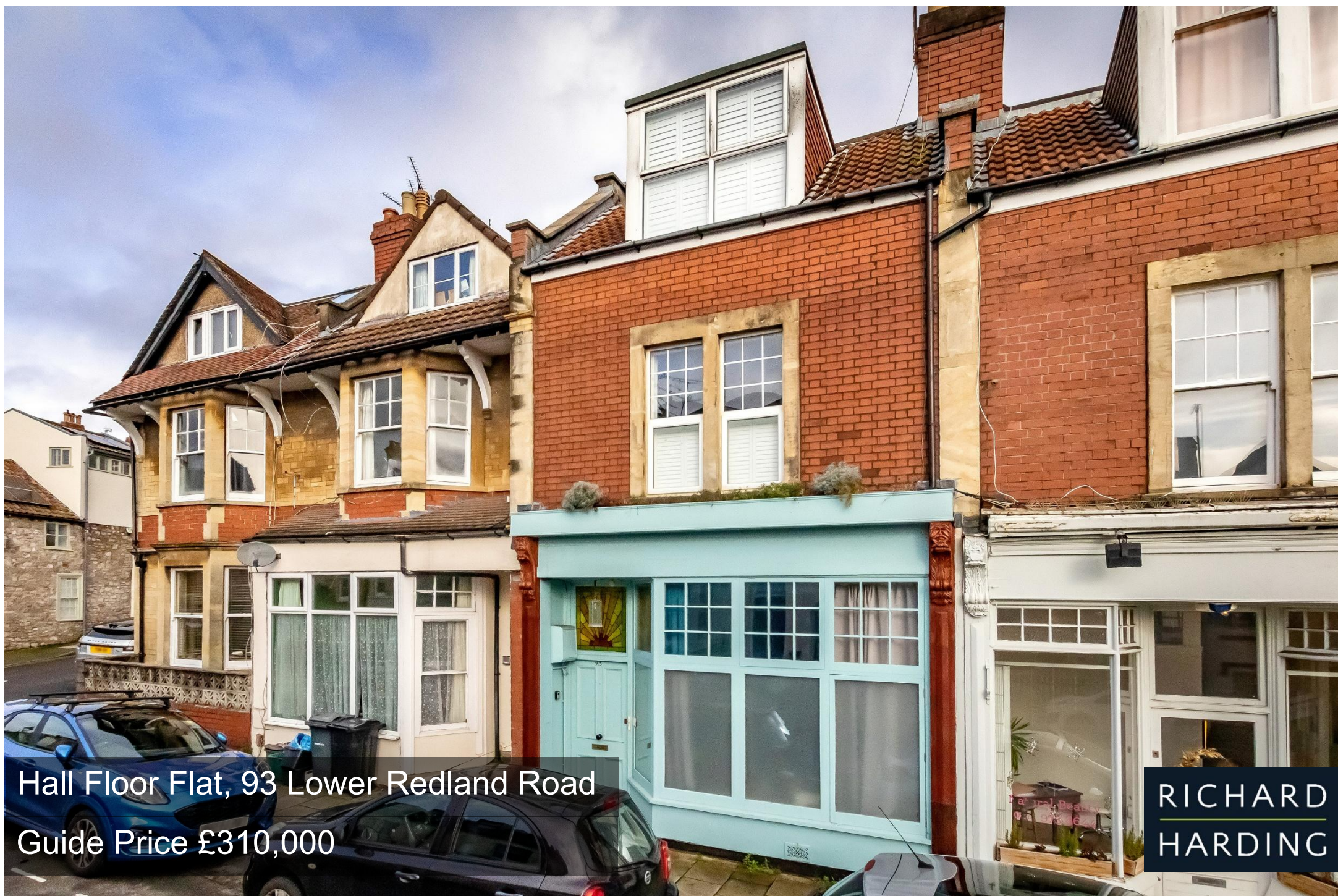
Hall Floor Flat, 93 Lower Redland Road Guide Price £310,000