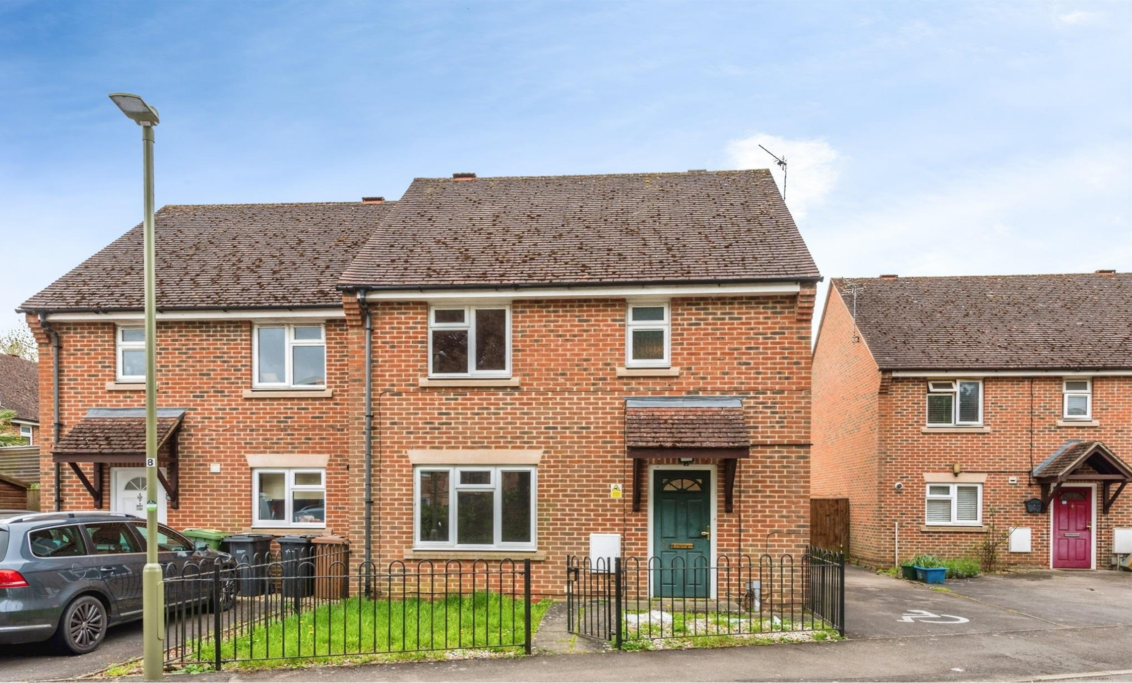
Tower Close, Abingdon, OX14 5US