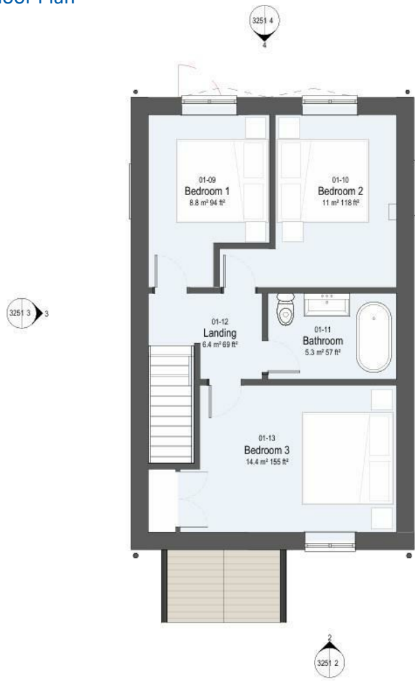
2 First Floor 1 : 50