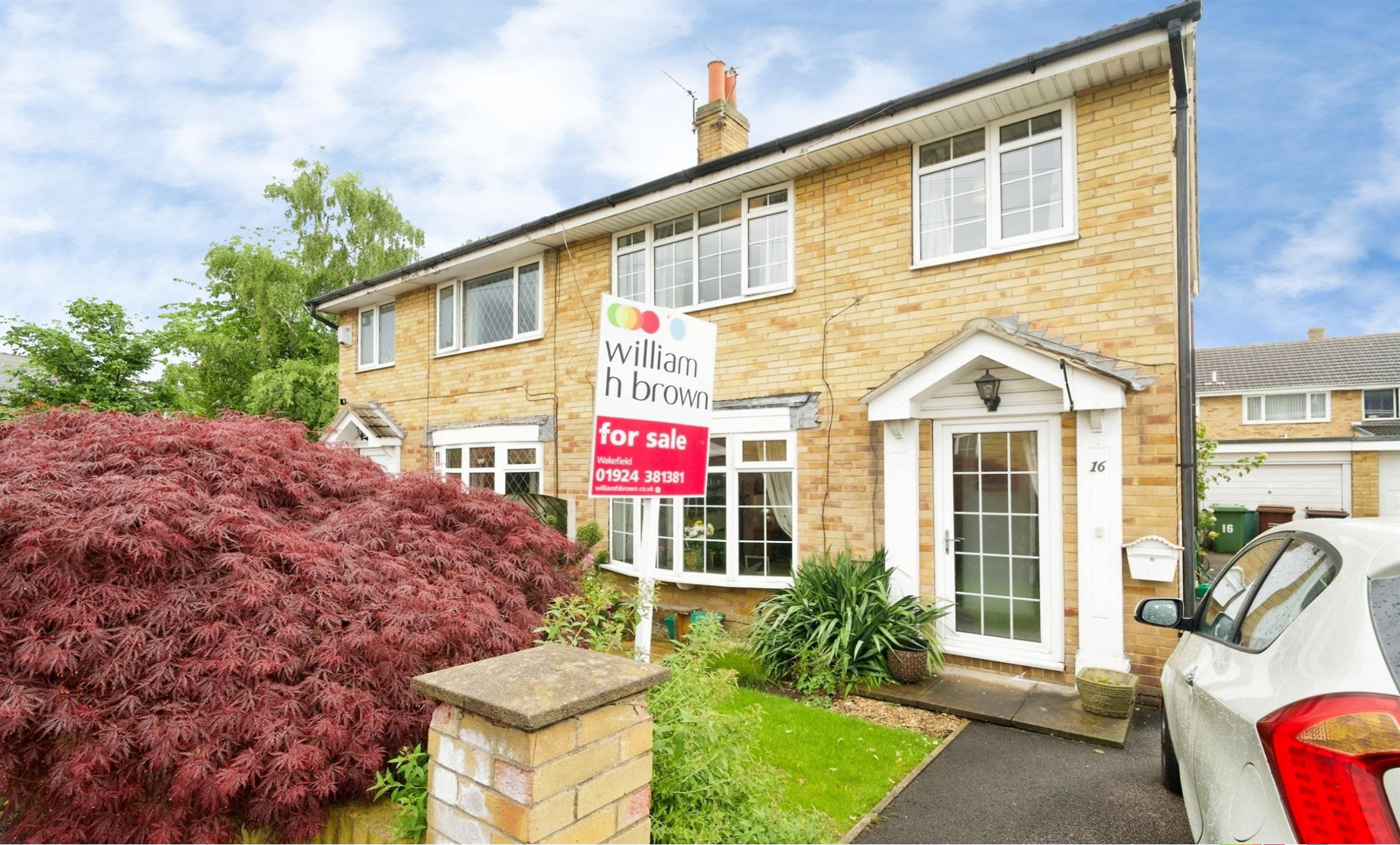
Thornleigh Croft, WAKEFIELD WF2 7SQ