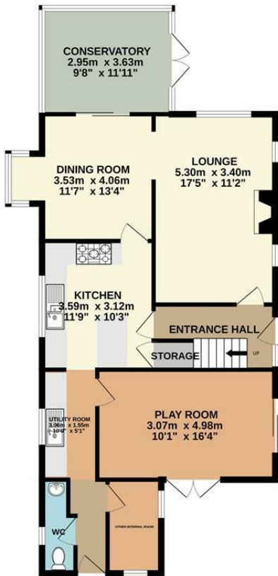
GROUND FLOOR 86.6 sq.m. (932 sq.ft.) approx.