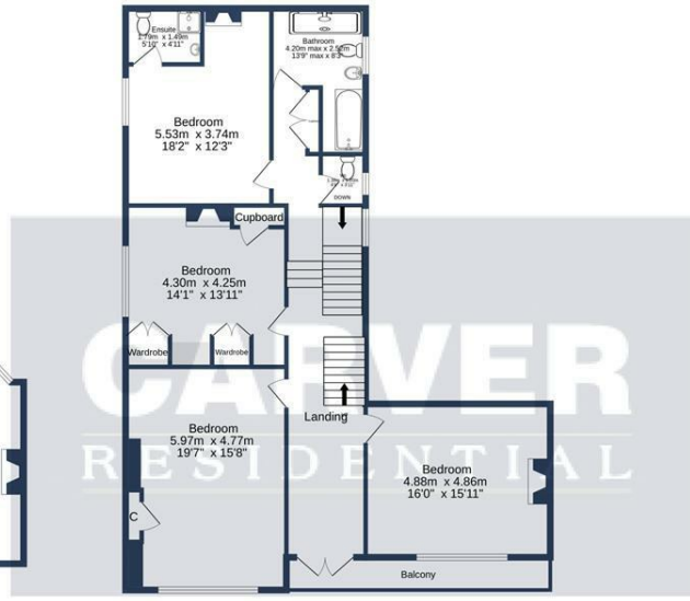
1ST FLOOR 116.0 sq.m. (1249 sq.ft.) approx.