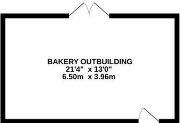
GROUND FLOOR 825 sq.ft. (76.6 sq.m.) approx.