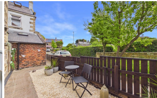
2 THE WARREN, HINDERWELL- 2 bed Cottage -£179,950