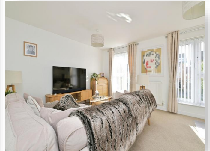
Bentley Grove, Peterborough PE3 6GY